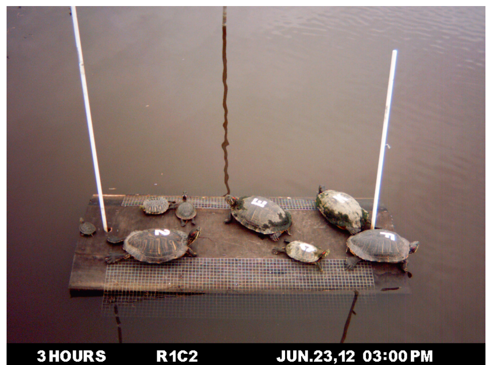
Figure 1. Marked Trachemys scripta recaptured by a camera trap during a pilot study of a closed population near Springfield, Illinois, USA.

pond. Cameras were positioned to provide opposing fields of view of rafts. Bluett and Cosentino (2013) described rafts and cameras (Wingscapes® Timelapse Plantcam™; Alabaster, Alabama, USA) in detail. Briefly, we programmed the time-lapse cameras to take high resolution photos (2560 X 1920 pixels) at 0900, 1200 and 1500 hrs and set focus distance to infinity. Photos were imprinted with time lapse interval, date, time, and a code that allowed us to distinguish individual rafts and cameras (Fig. 1). We used data from the first 20 days of deployment (until 6 June) to estimate the minimum number of turtles remaining in the fenced pond after removals.