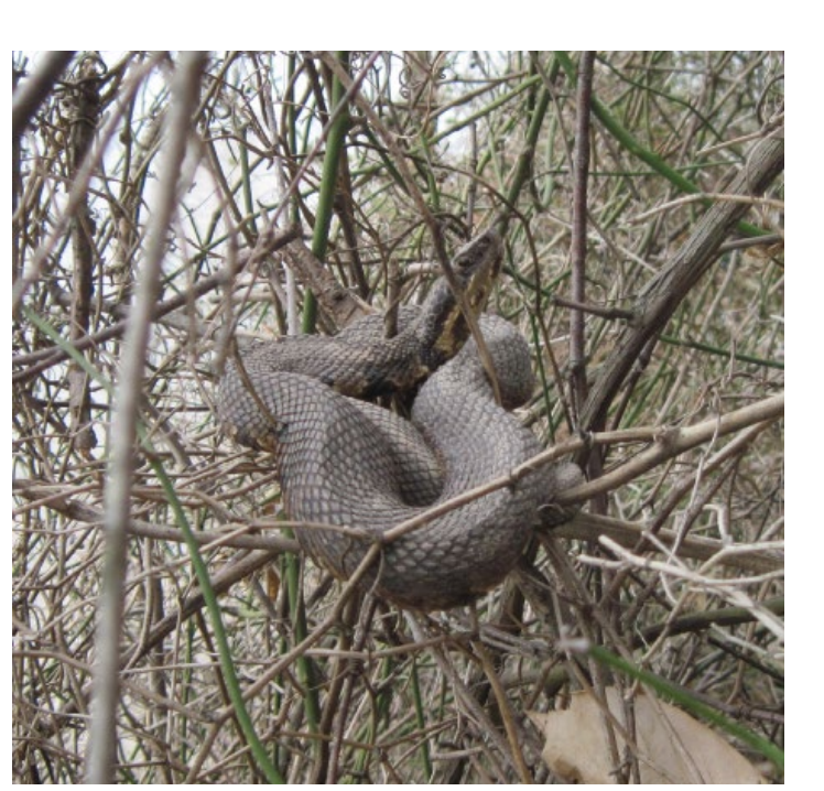
Figure 1. Adult Agkistrodon piscivorus coiled in vines 0.75 m above the ground at the edge of a southern Illinois wetland in April 2014.

Although juvenile snakes (46.4%) and adult snakes (41.1%) were