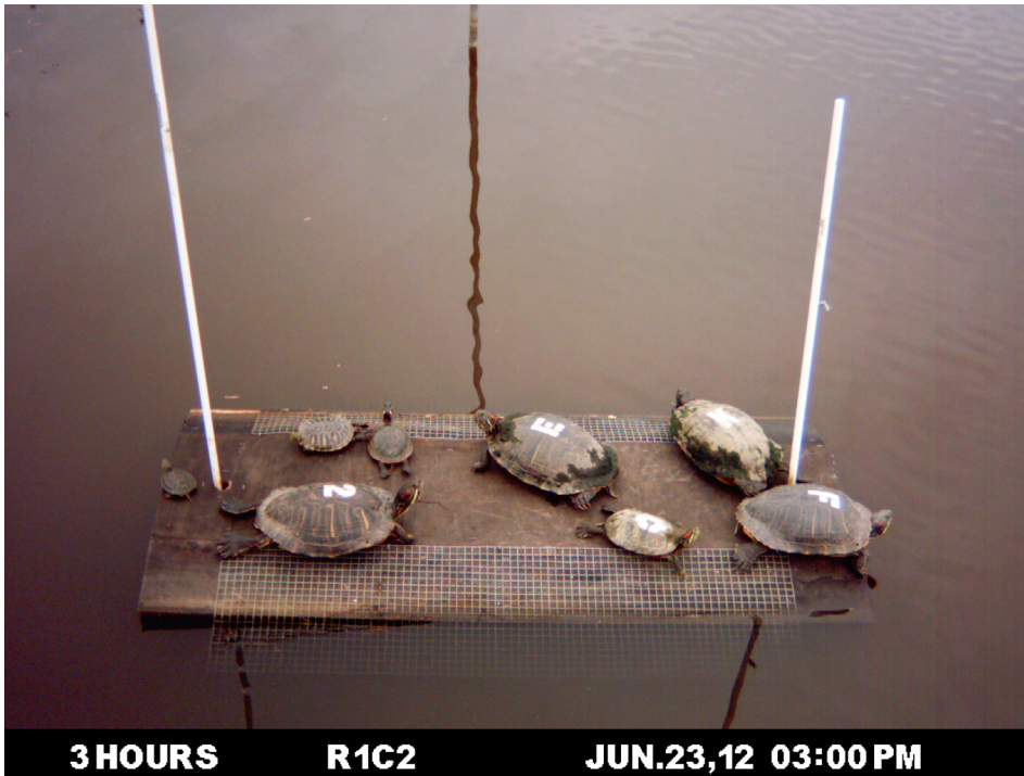
Figure 1. Marked Trachemys scripta recaptured by a camera trap during a pilot study of a closed population near Springfield, Illinois, USA.

pond. Cameras were positioned to provide opposing fields of view of rafts. Bluett and Cosentino (2013) described rafts and cameras (Wingscapes® Timelapse Plantcam™; Alabaster, Alabama, USA) in detail. Briefly, we programmed the time-lapse cameras to take high resolution photos (2560 X 1920 pixels) at 0900, 1200 and 1500 hrs and set focus distance to infinity. Photos were imprinted with time lapse interval, date, time, and a code that allowed us to distinguish individual rafts and cameras (Fig. 1). We used data from the first 20 days of deployment (until 6 June) to estimate the minimum number of turtles remaining in the fenced pond after removals.