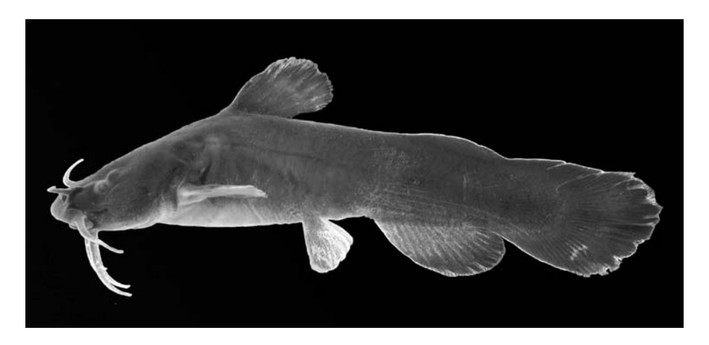
Figure 2. Freckled madtom Noturus nocturnus 105.89 mmTL, Des Plaines River, Will County, IL 16 May 2005 (FMNH Accession number Z-19815).